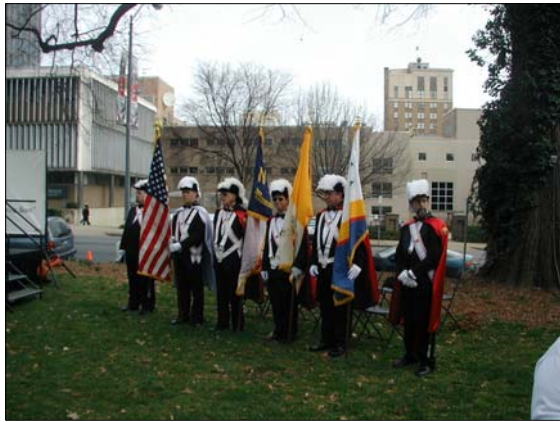
Color Guard at Raleigh Rally for Life